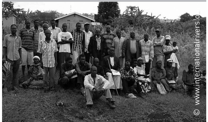
Community affected by Bujagali.

According to the EIB’s Environmental and Social Practices Handbook, it is the duty of the Project Directorate to “signal, as early as possible in the appraisal cycle, if [...] [the project] might be seriously adversely affected by the results