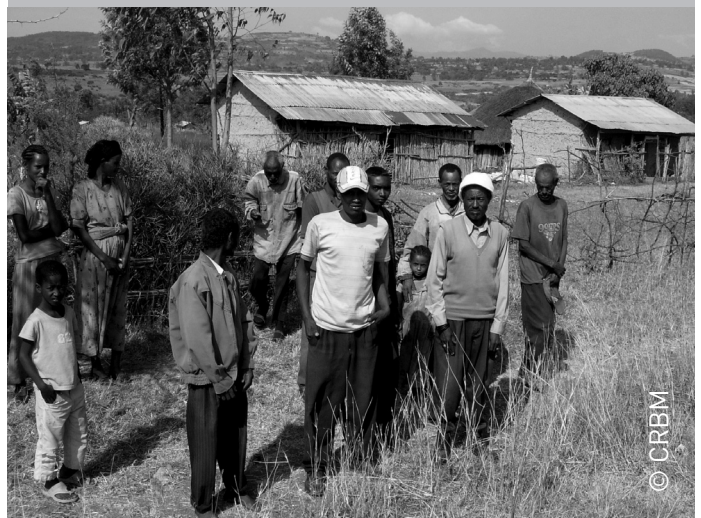
Displaced communities around the Gilgel Gibe reservoir

Gilgel Gibe is the name for a series of hydroelectric plants in the Omo river basin in South-western Ethiopia. Project development is to be undertaken by the EEPCo, the state-owned electric utility in Ethiopia. Gilgel Gibe I is a 40 metre high dam that generates 183 MW. It has been operational since 2004. Gibe II is a 25 km long tunnel generating power exploiting the drop between the basin created by the Gilgel Gibe I dam and the Gibe river. Gibe II is not yet fully in operation. Gilgel III would be the biggest hydro project in Ethiopia, with a 240-metre dam wall, at